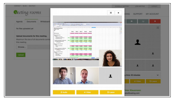
You share the screen...